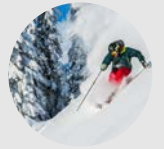
Skiing NOV - APR