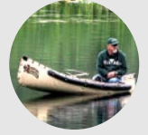
Canoeing MAR - OCT