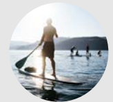
Paddle Boarding YEAR ROUND