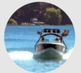
Boating MAY - OCT