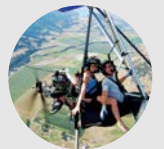
Paragliding MAR - OCT