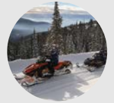
Snowmobiling NOV - APR