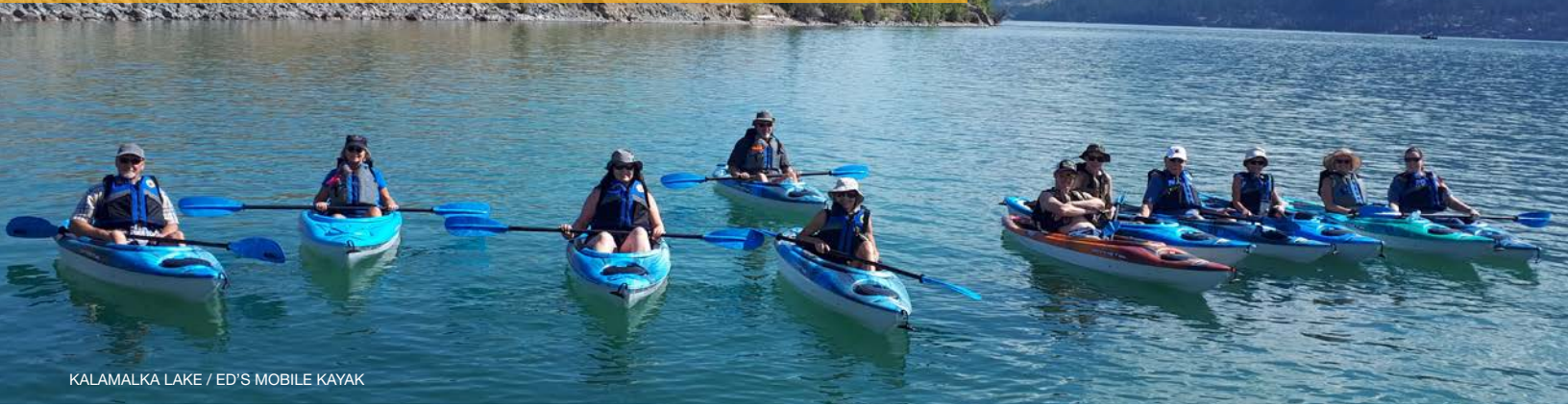
KALAMALKA LAKE / ED'S MOBILE KAYAK

GENERAL TOUR INFORMATION | VERNON, BRITISH COLUMBIA