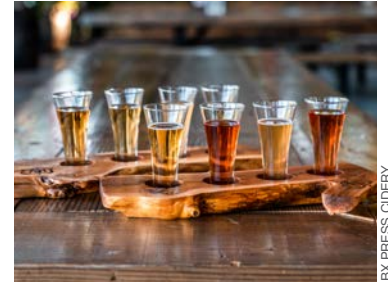
BX PRESS CIDERY